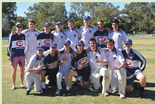
Emmanuel College ICC Cricket champs