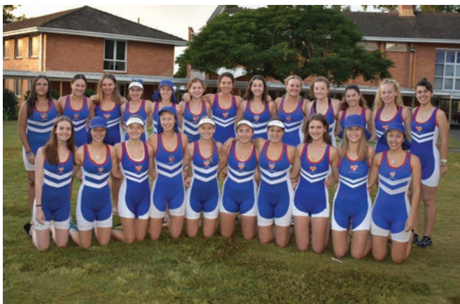
Emmanuel's women's rowing crew ready for the ICC regatta

The next big event was our first lead-up regatta where all of our women's crews took out first, second or third in their races and we came away with a second overall! Another three weeks of training passed during which we all increased our number of off-water training sessions, worked harder during our on-water sessions and continued to perform incredibly well at all lead-up regattas.