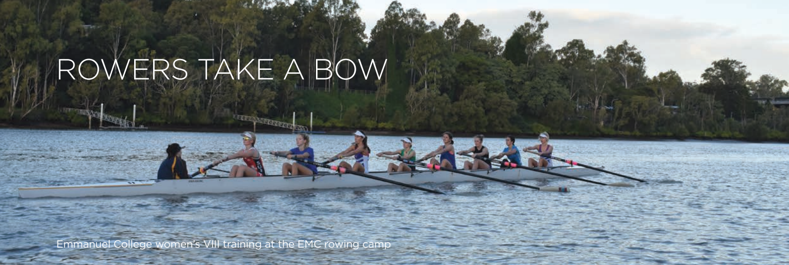
Emmanuel College women's VIII training at the EMC rowing camp