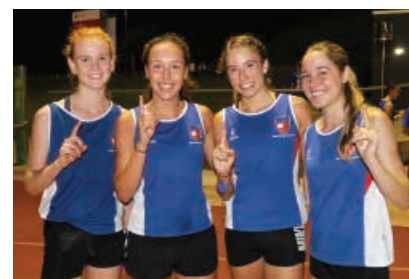
Cross Country 4 X 1500m relay winners

Thank you to all participants, convenors, coaches, staff and supporters for making 2018 an enjoyable and successful year for sport at Emmanuel.