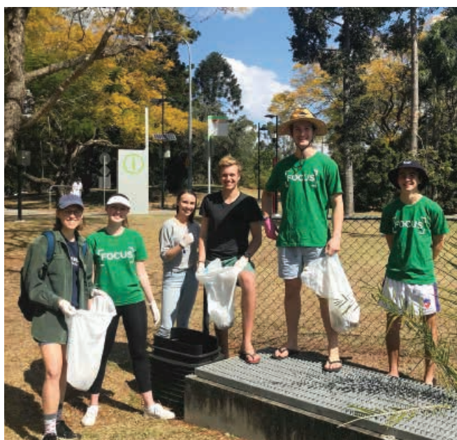
UQ Lakes Clean Up with the UQU Environment Collective

This semester has been a very successful one for community service at Emmanuel. We participated in more events and raised more money for more organisations than any previous year. Any time or energy you contribute to service makes a difference, no matter how great or small, so I hope all of the students at Emmanuel who got involved in community service activities this year are proud of their contributions.