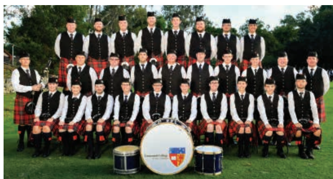
Emmanuel College Highlanders at the 2018 Australian Pipe Band Championships

Pipe Bands Australia ended the 2018 competition year by recognising the band's two years of accomplishments in Grade 3 with a promotion to Grade 2, which is the highest level of pipe band competition currently represented in Australia. As well as winning three local competitions in Maclean (NSW), Redlands, and Warwick, the Emmanuel College Highlanders defended their title as Grade 3 Queensland Champions for the second year in a row. The band also participated in the biennial Australian Pipe Band Championships, held at Brisbane Boys' College in April, where we were awarded second place.