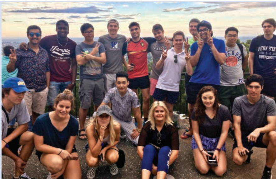
Emmanuel's international students enjoy a day out at Brisbane's Mount Coot-tha

Serving as the Emmanuel College International Student Coordinator in 2018 has been an amazing experience. This year we welcomed a wide range of international students into our Blue Dog family. We have had people from every corner of the world including Belgium, Malaysia, Switzerland, Ireland, Singapore, India, America, Canada, Zimbabwe and the UK — almost every continent! All of our international students brought something new to the Emmanuel culture with their unique personalities, mixing in to make College a fun and exciting environment to live in.