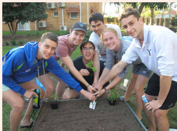
Emmanuel College's student-run community garden

In August we ran our first EMC Sustainability Week focusing on food and textile waste, recycling, water and electricity use. We can all be more mindful of what we can do for a sustainable future. At Emmanuel, we're taking steps in the right direction.