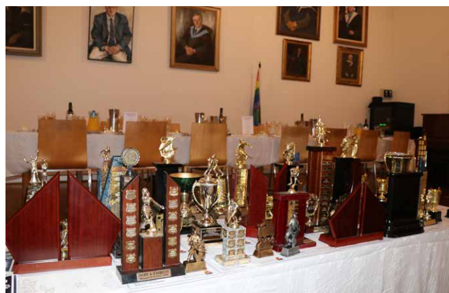
2019 Sports Awards Dinner

sporting teams throughout year. Having people dressed in kilts and sashes or with blue paint covering their backs cheering you on really makes you want to score that extra goal.