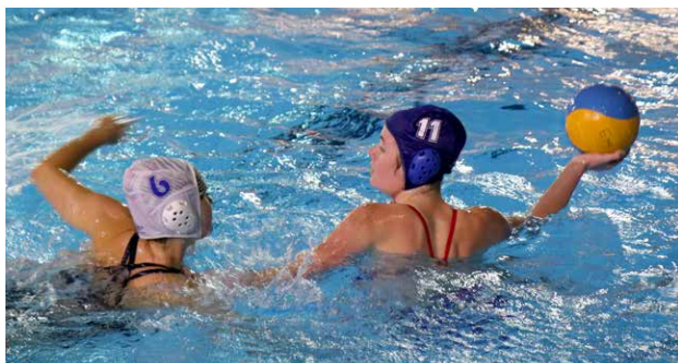
EMC women's water polo premiers