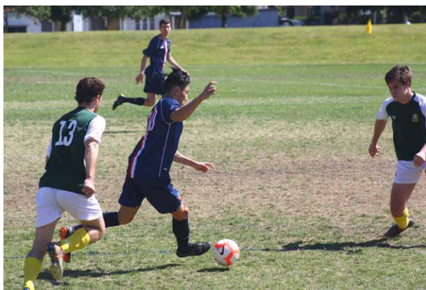
EMC men's football premiers