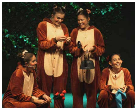
Theatre Restaurant 2019 – Botanical Bother