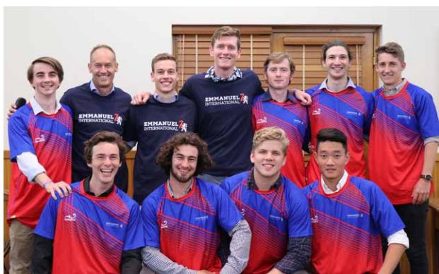
Emmanuel sports coaches