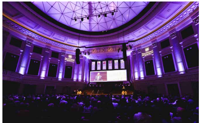
Courting the Greats at Brisbane City Hall